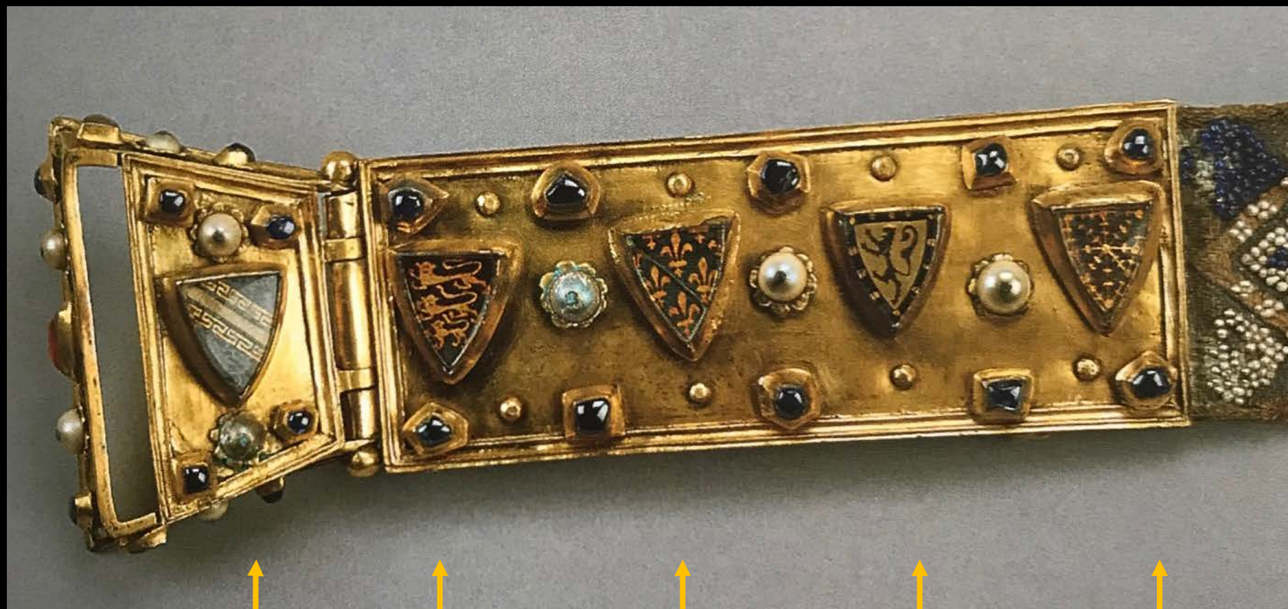
Thibault Count of Champagne